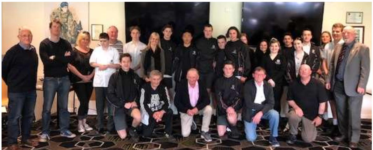
Year 11 VCAL students together local Victorian Vietnam Veterans