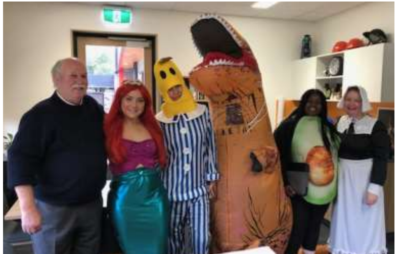
Year 12 Name Day